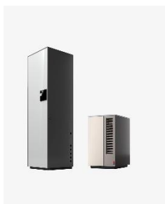
Image 4: System M Pure impresses with its reduced, clear design. With 60 x 50 x 87 centimetres, the outdoor unit is the smallest on the market and is available in the colour grey aluminium / silk grey. The indoor unit with a footprint of 60 x 60 centimetres takes up less space than any other heat pump and no more than a washing machine.

Image 3: The System M Pure version is controlled via the GDTS Home App. Desired temperature, settings for the weekend or holiday... everything works with a finger tip.