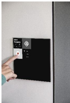
Image 2: With System M Pure, the display of the indoor unit acts as a status indication. The control takes place via the GDTS Home App: Tap once on the “M” logo symbol on the indoor unit display and the connection takes place with just a few clicks.

Image 1: System M Pure from Glen Dimplex Thermal Solutions is the perfect heat pump for small to medium-sized homes. It is not only extraordinarily quiet and highly efficient: It impresses with a clear design, compact dimensions and intuitive control directly via smartphone.