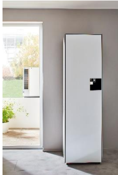
Image 1: System M Pure from Glen Dimplex Thermal Solutions is the perfect heat pump for small to medium-sized homes. It is not only extraordinarily quiet and highly efficient: It impresses with a clear design, compact dimensions and intuitive control directly via smartphone.